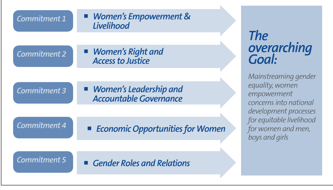
Figure 1 : Policy Commitment Value Areas